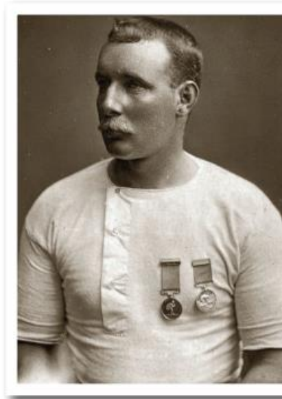
Captain Matthew Webb