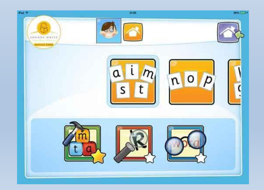
Sounds Write App

https://www.udemy.com/course/help-your-child-to-read-and-write/ Udemy SoundsWrite Course